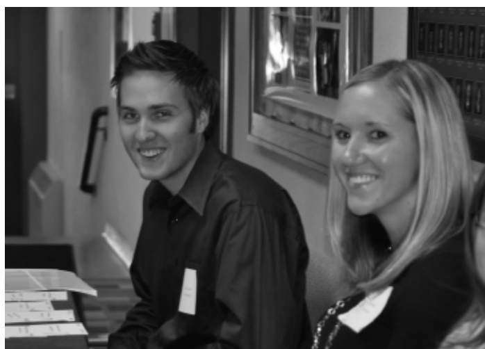
Students at the Event Registration Desk